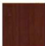
Cherry oak, nr 3202001