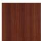
Macore, nr 3162 002