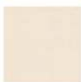
White creme, nr 1379 05-167