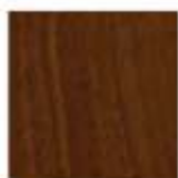
Noce Sorento Balsamico, nr 4393 042