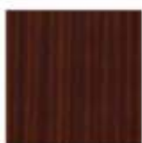
Mahagon (mahoni), nr 2097 013