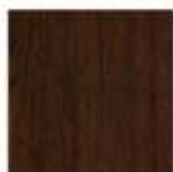
Dark oak, nr 2052 089