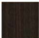
Marsh oak, nr 3167 004